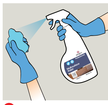
3 Shake well and spray solution onto a cloth.