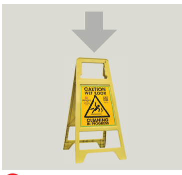
2 Place safety signs.