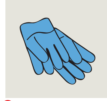
Use appropriate PPE as indicated in the safety data sheet.